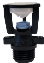
1/2" Male Base

Wobbler ..... $ 3.25 Nozzle Only ..... $ 0.75 Nozzle Part# MWNZ (Specify Color)