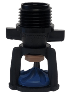
1/2" Male Base

Wobbler ..... $ 3.25 Nozzle Only ..... $ 0.75 Nozzle Part# MWNZ (Specify Color)