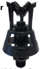
1/2" Male Base