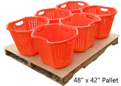
48" x 42" Pallet