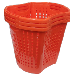
1" Stacking Height