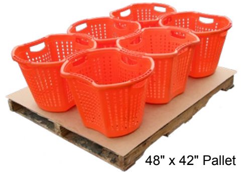
48" x 42" Pallet