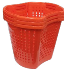
1" Stacking Height