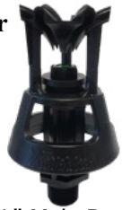
1/2" Male Base

Wobbler ..... $ 7.50 Nozzle Only ..... $ 0.85 Nozzle Part# NZIN (Specify Color)