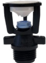
1/2" Male Base

Wobbler ..... $ 3.25 Nozzle Only ..... $ 0.75 Nozzle Part# MWNZ (Specify Color)