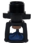
1/2" Male Base

Wobbler ..... $ 3.25 Nozzle Only ..... $ 0.75 Nozzle Part# MWNZ (Specify Color)