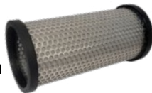
1½" & 2" Screen

150 Mesh.....Black..... For Drip 50 Mesh..... Yellow..... For Sprinklers 30 Mesh..... Orange..... For Sprinklers