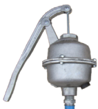
6" Wade Rain