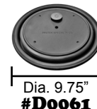
Dia. 9.75" #D0061