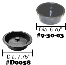
Dia. 7.75" #D0058