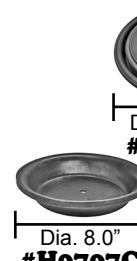
Dia. 8.0" #H0707C