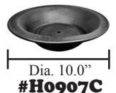
Dia. 10.0" #H0907C