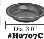
Dia. 8.0" #H0707C