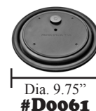
Dia. 9.75" #D0061