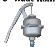
6" Wade Rain