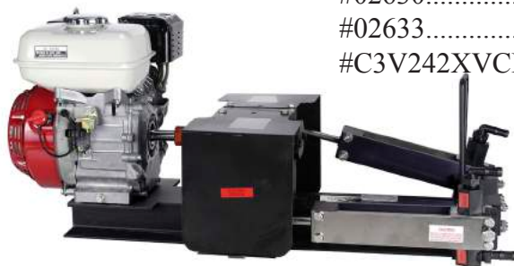
John-Blue Honda Powered Fertilizer Injector Pump. 10-100 GPH