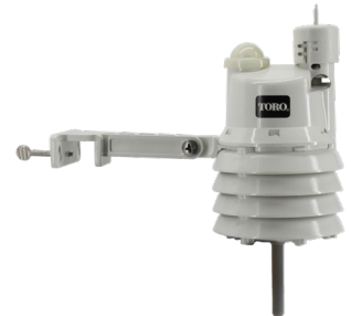
Wireless Weather Sensor