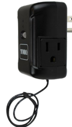
Wireless Auxiliary Relay