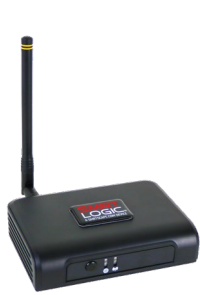
Smart Connect Plug-In Receiver

12 Zone Module.....EMOD-12 ..... $ 105.00