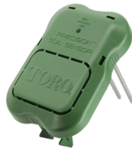
Wireless Soil Sensor