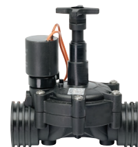
Netafim Dorot Brand Plastic