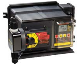
Chem-Feed 110 Volt .5-10 GPH