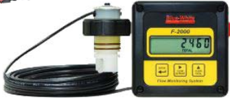
RTA Flow Meter