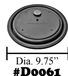
Dia. 9.75" #D0061