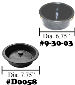
Dia. 7.75" #D0058