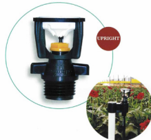
Upright wobbler performance chart based on 1.5 ft. riser height.