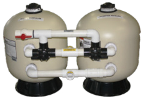
Two TR60 filters with manifold